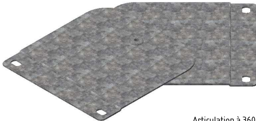
Articulation à 360°

Poids net: 0.440 Kg Matière: TÔLE GALVA 1.50 DX51D + Z275 Revêtement: Z275 - NF EN 10346 Colisage: 5 pièces